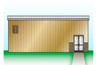
Proposed new facility