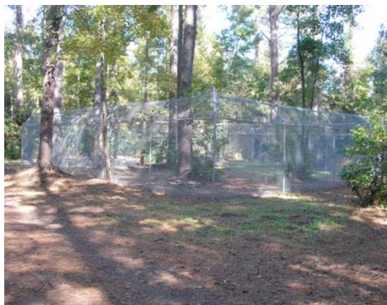
New pen

Sandy Ridge is a red wolf holding facility located on the Alligator River National Wildlife Refuge. During Hurricane Isabel on September 18, 2003, all but one of the 1 pens was damaged. During the following year, only 5 to 6 were able to be made functional. Eventually the field crew was able to piece together other damaged pens to create a total of 8 pens functional for late 2005 up to September 2006.