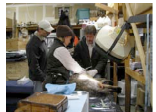
Current garage space

A kiosk donated and built by an Eagle Scout Troop, will be installed outside the facility, further educating the public about red wolf recovery in northeastern North Carolina.